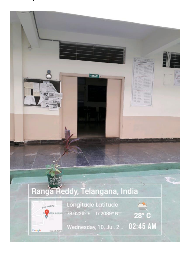
library Gate register